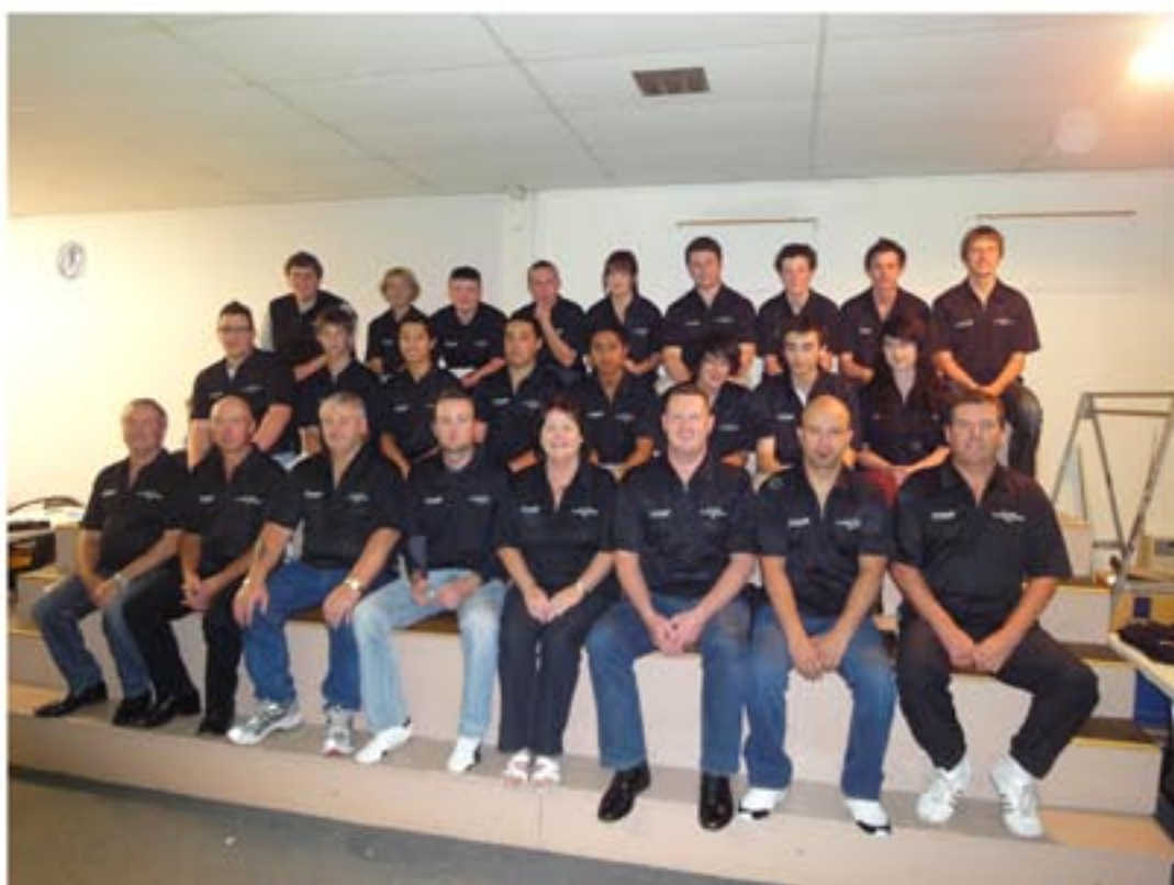
New Juniors Programme and Academy Schedules

New Zealand Championships June 30th & July 1st B Grade Snooker July 2 to 7th NZ Snooker Champs July 8th & 9th B Grade Billiards July 10th to 14th NZ Billiards Champs